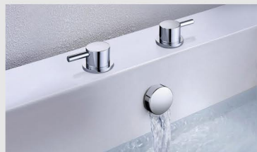
Waste & Overflow Valves