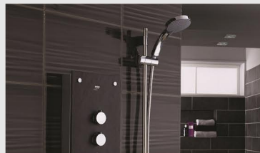
Showers & faucets