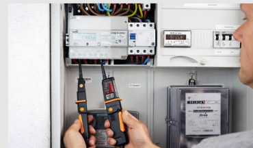
High & low voltage systems