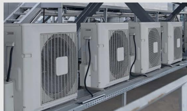
HVAC, heating & cooling systems