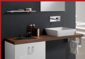
Custom vanity sinks

UPTO 25% OFF On All Services (Limited Offer)