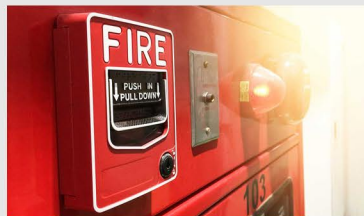
Fire alarm & fire fighting systems