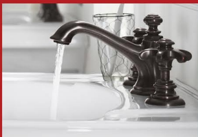
Tap & Sink Replacements