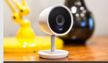
Security & CCTV cameras

Our solutions give you the peace of mind to make sure your office equipment will have no disruption during its opening hours.