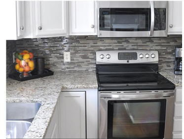
Kitchen Face Lifts