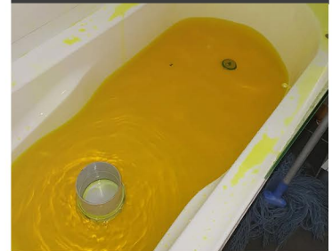
Dye and Flood Testing