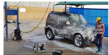
Car Wash Bays