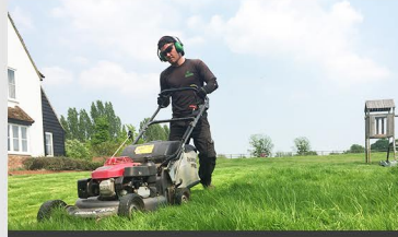
Building & grounds maintenance